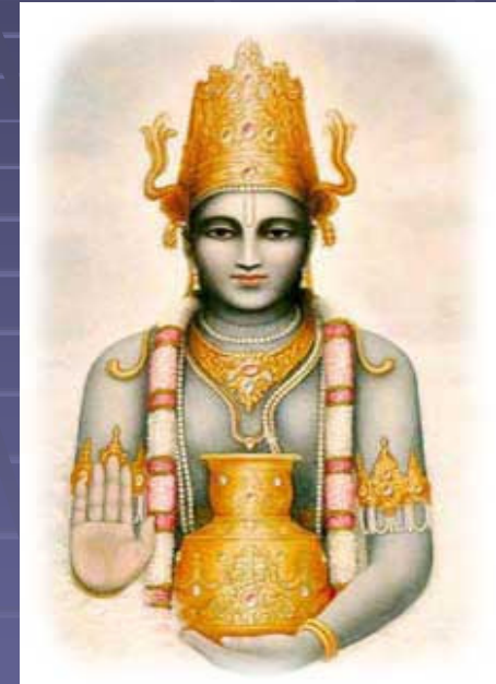
Lord Dhanvantari-The Father of Surgery

Email: chakrapany2006@yahoo.co.in chayaka2003@yahoo.com