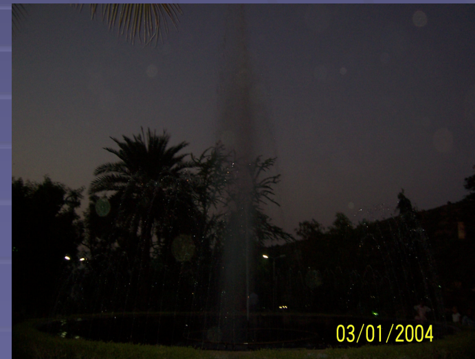
Night Scenario of Fountain Park