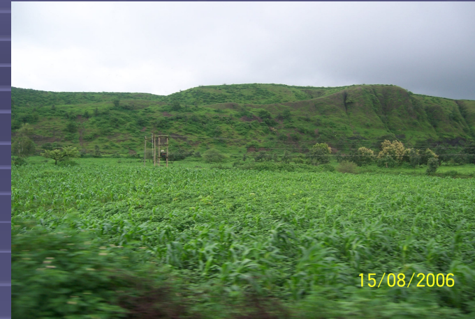
Greenery in Rural Area