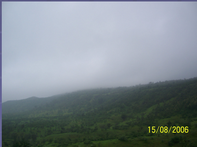
Clouds over the Peak of Mountain