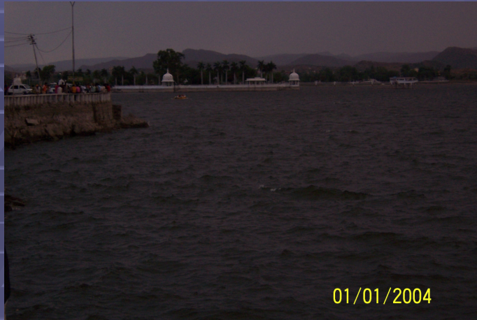
Fatehsagar Lake and Island Park